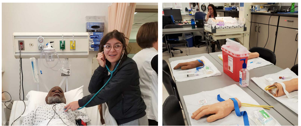
CMC Nursing Simulation Lab